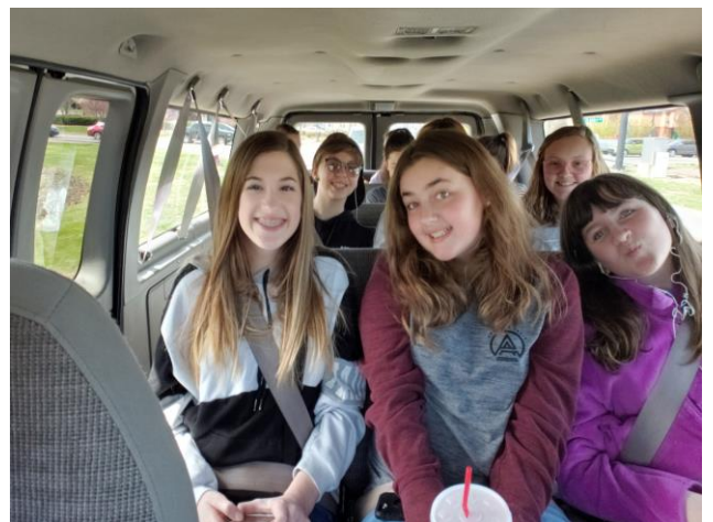
Girl's outing recently to do some thrift store shopping.